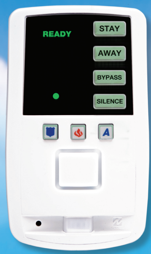
Rest easy. In an emergency, day or night, our seasoned central station professionals are monitoring your advanced system, so they can quickly summon the help you need in any burglary, fire or panic alarm crisis.