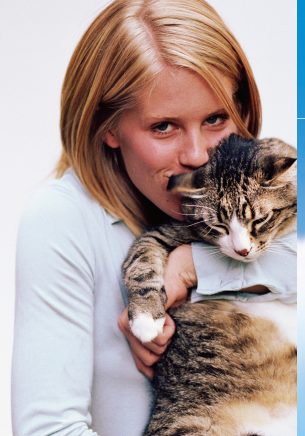
Freedom from accidental alarms