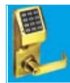
Lever set in US3 DL2700/3