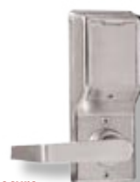
Secure battery compartment on inside door