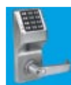
With IC Core in 26D DL2700IC/ 26D