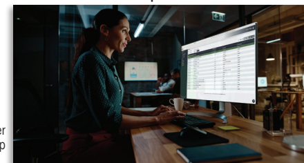
Web Browser & App