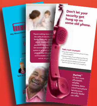
Free Sales Trifold Mailers for New & Existing Accounts (Part No. A606)