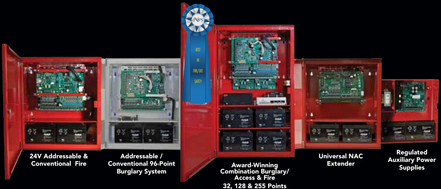
24V Addressable & Conventional Fire