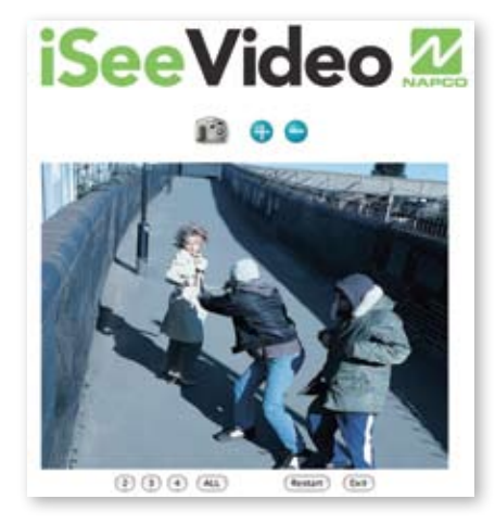
Security cameras in walkways and parking lot provide added security for customers and employees.