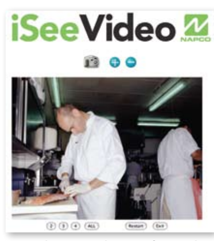
Keep tabs on employee safety and sanitary procedures in restaurants, like being in two places at once.