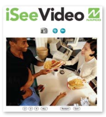
Allow your accounts to watch over their cash register and the quality of their customer service.