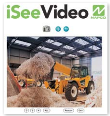
Protect accounts' valuable equipment in construction and agriculture