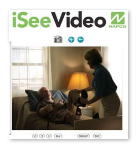
Watch over caregivers and elderly relatives and let them stay independent longer and safer.