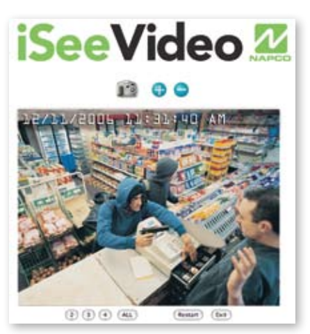
Video is time- and date-stamped, essential for use as evidence.