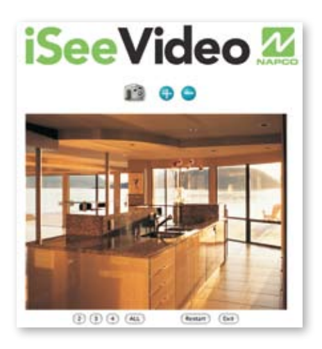
Keep an eye on second homes or summer homes with no computer necessary on premises.