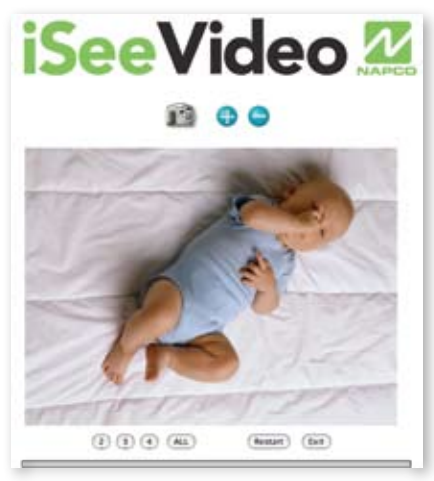
Monitor babysitters and nannies, and with security system integration offer more advanced capabilities than video alone.