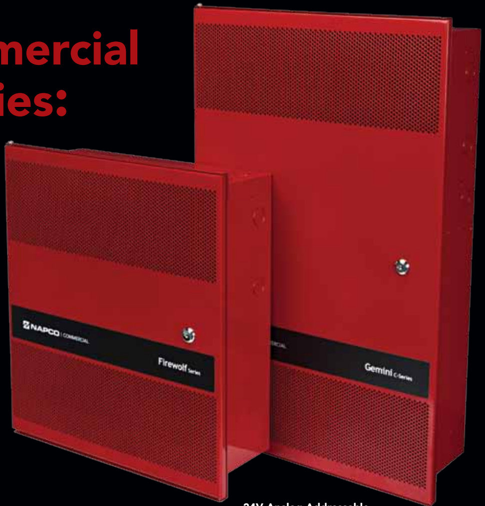
24V Analog Addressable, Wireless and Conventional Fire, 255, 128 or 32 point kits

Robust, flexible 24V commercial fire systems supporting up to 255 zones/points using all-new fire devices in hardwire, wireless, conventional & addressable technologies