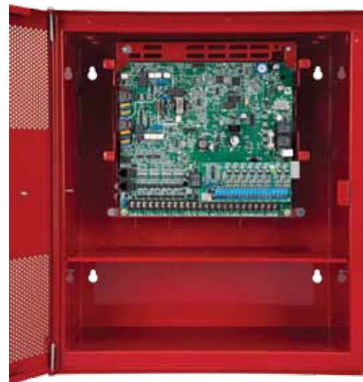
(Shown above) 32-Point GEM-C Firewolf™ 24V Commercial Fire System